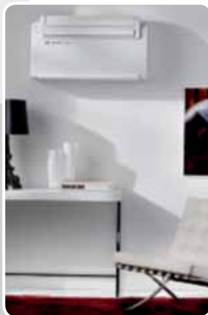
B. Installation on higher part of wall