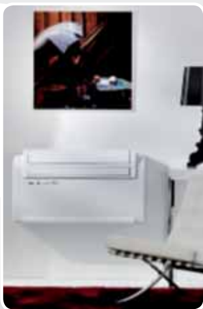
A. Installation on lower part of wall

Unico inverter DC has been designed and developed for low or high installation. Thanks to innovative technical features, a few minutes is all it takes to prepare the machine for either type of installation. The installation of the unit requires no outside work: this means no difficult procedures and reduced costs. The visual impact on the outside wall is minimal with only two small grilles installed (each 202 mm diameter).*